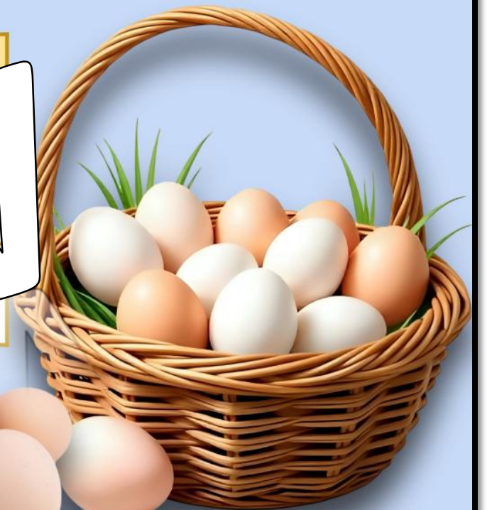
Business Education with Denise Leigh © 2025

Search the web to information on why eggs prices are up in 2025 and scarce in some parts of the country. Record 4 bits of information about your findings below.